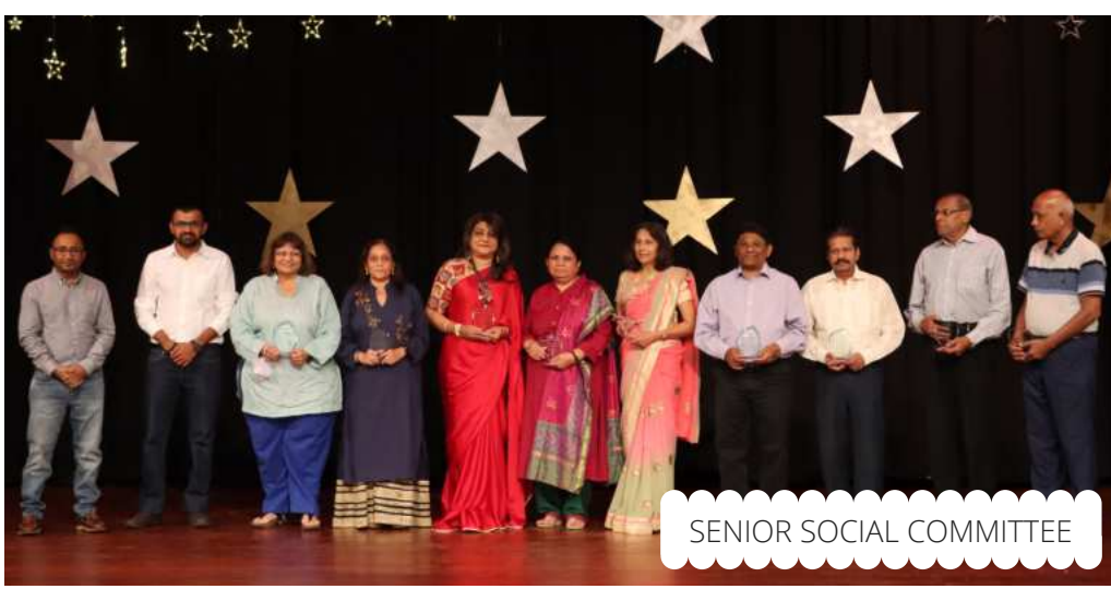
SENIOR SOCIAL COMMITTEE