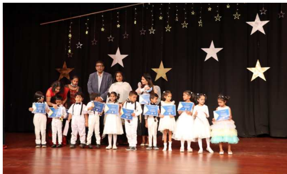
CULTURAL PROGRAM THE OSHWAL ACCADEMY NURSERY, PRIMARY, JUNIOR HIGH & SENIOR HIGH STUDENTS