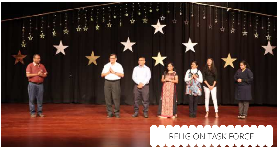
RELIGION TASK FORCE