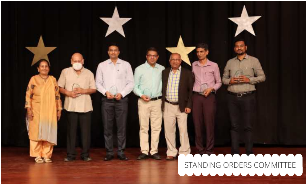
STANDING ORDERS COMMITTEE