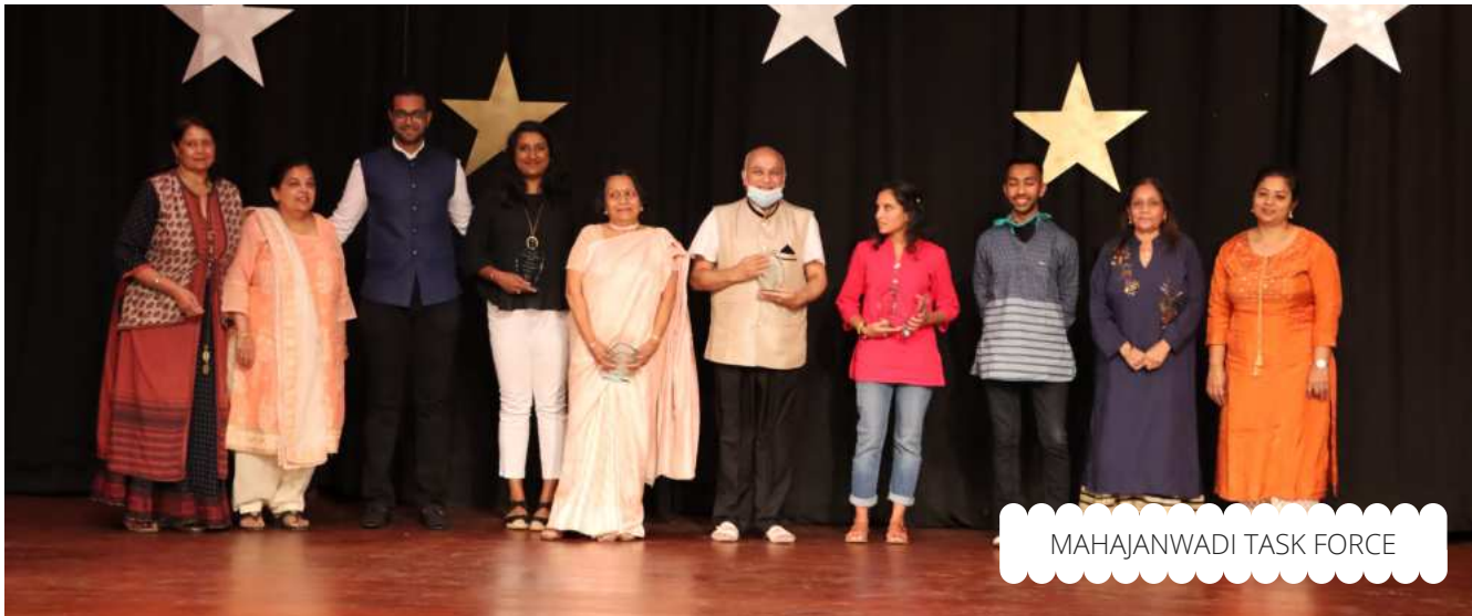
MAHAJANWADI TASK FORCE