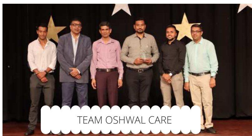
TEAM OSHWAL CARE