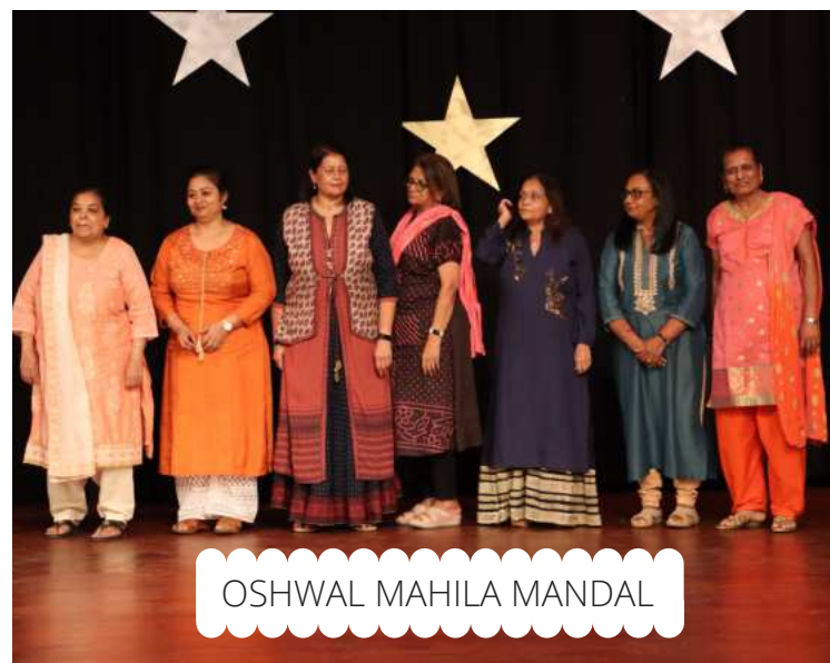
OSHWAL MAHILA MANDAL