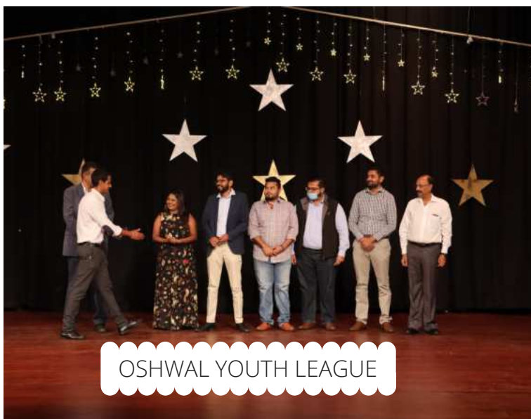
OSHWAL YOUTH LEAGUE