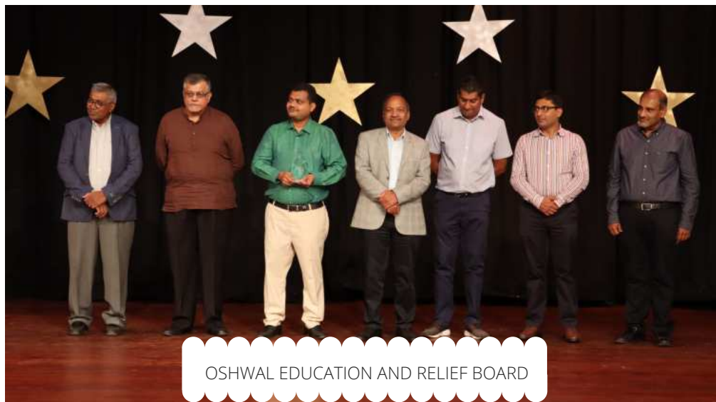
OSHWAL EDUCATION AND RELIEF BOARD